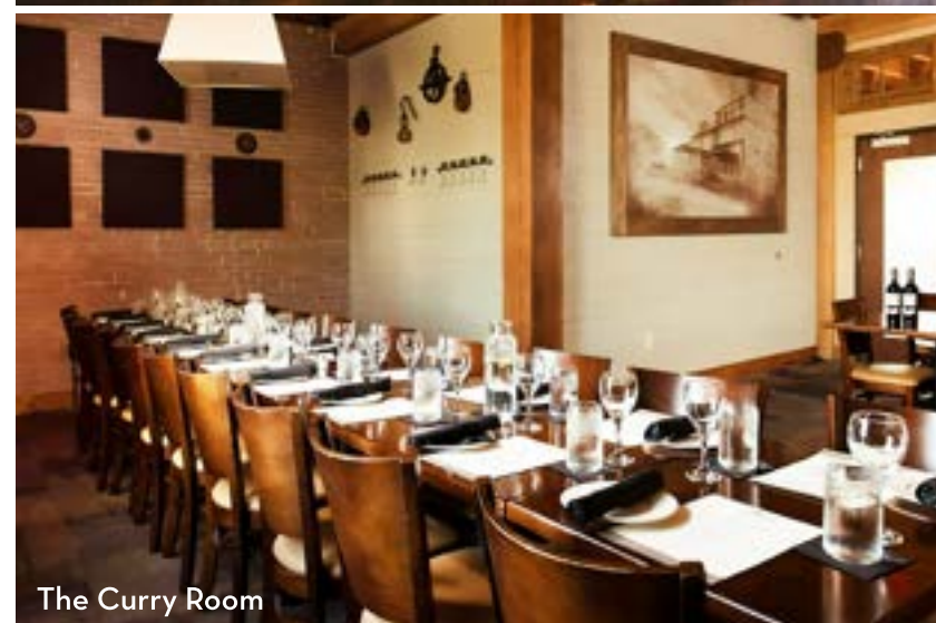
The Curry Room

Our top floor will certainly leave a lasting impression with its 25 foot high vaulted ceiling and unique wood elements. For larger groups up to 80 guests , you will have the entire floor with a beautiful view of the mezzanine, your own private bar, restrooms and an elevator giving easy access. For smaller groups up to 28 guests , the private Curry Room can become a separate intimate space giving you a unique atmosphere that includes high ceilings and beautiful posts & beams.